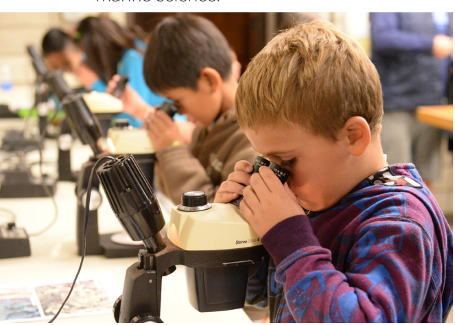
{\it Kids from all around OC experienced the wonders of science}.

Departments participating in activities include horticulture, technology, aviation, biology, chemistry, physics, geology, allied health, consumer and health sciences, and marine science.