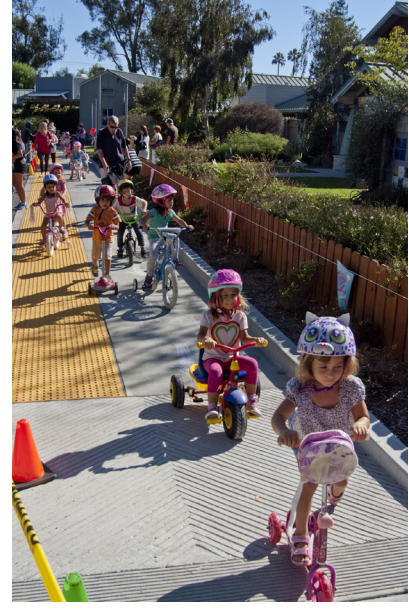
Children ride trikes for fundraiser

Children who participated solicited donations from family and friends to ride their bikes, trikes and scooters around a track