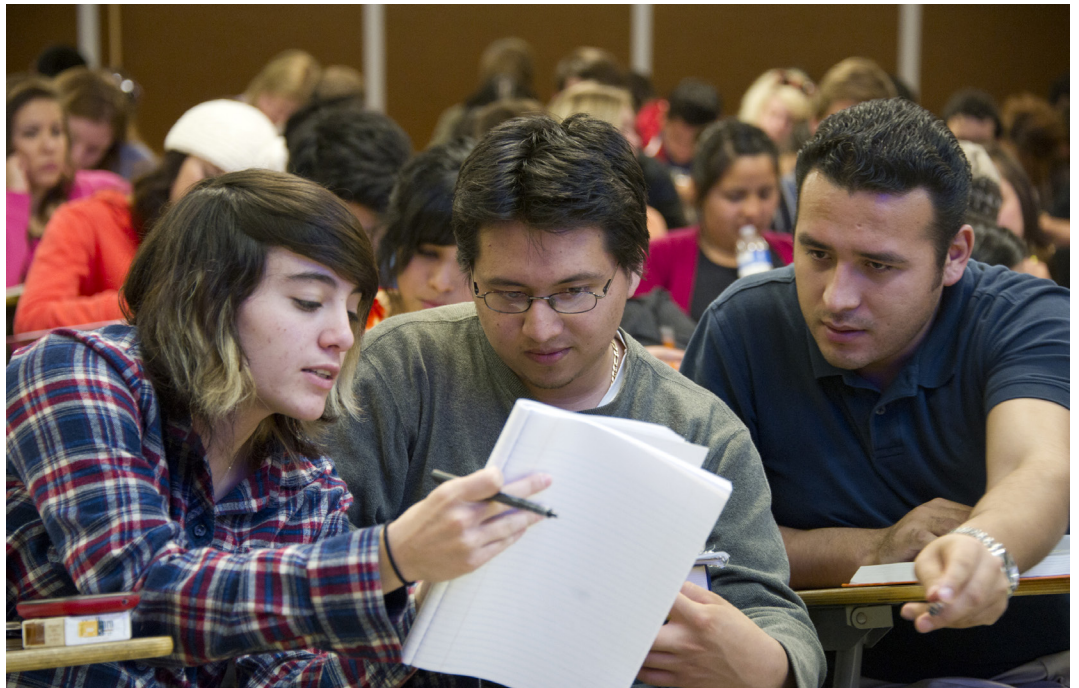
With more than 70,000 available seats, the Spring 2015 semester is one of the largest in recent years.

There are open classes in high-demand subjects such as math, science and English that students need to complete