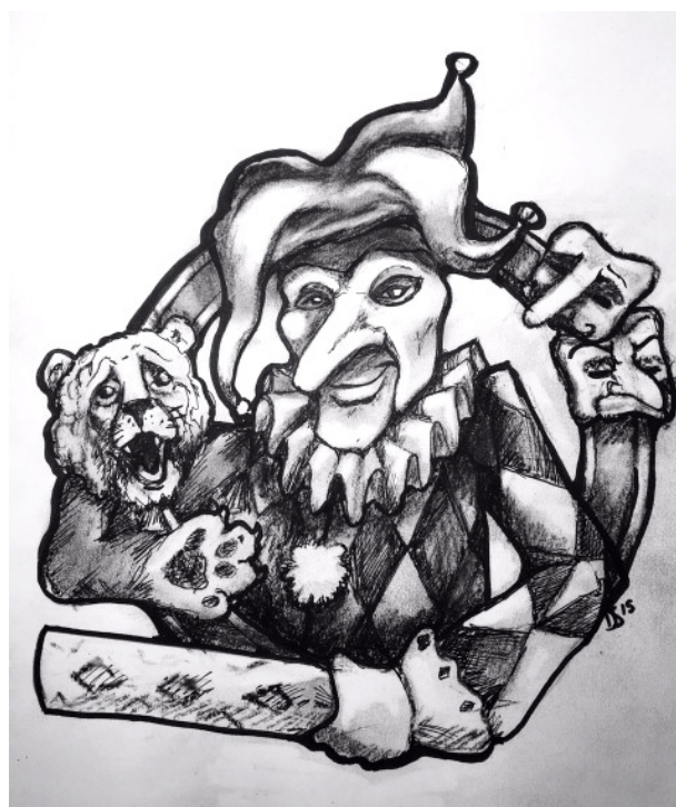
Androcles and the Lion opens at OCC on July 18.

Tickets will be available at the door and run $9 for adults and $7 for children, students and seniors. OCC's Drama Lab Theatre is located off Fairview Road and Merrimac Way, directly behind the College's Robert B. Moore Theatre. Parking is free on weekends, and metered parking is available during the week.